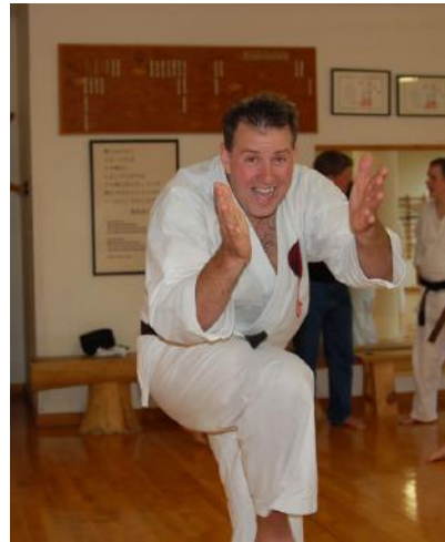
Reunion Anniversary Celebration.