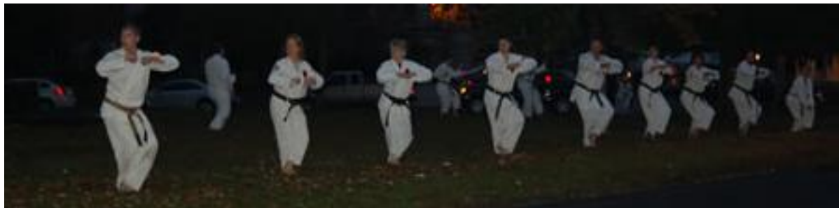
Bouchard Katathon.