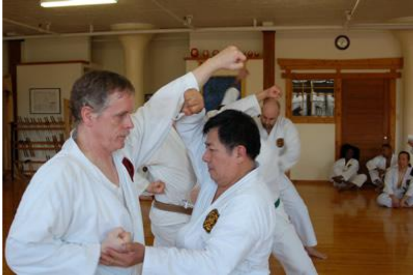
Rank Promotion 20 Feb 2010.