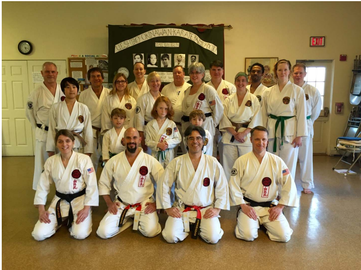
[Photo: After the February 27, 2016 karate workout and test, with visitors from the Northern Virginia Karate Clubs.]