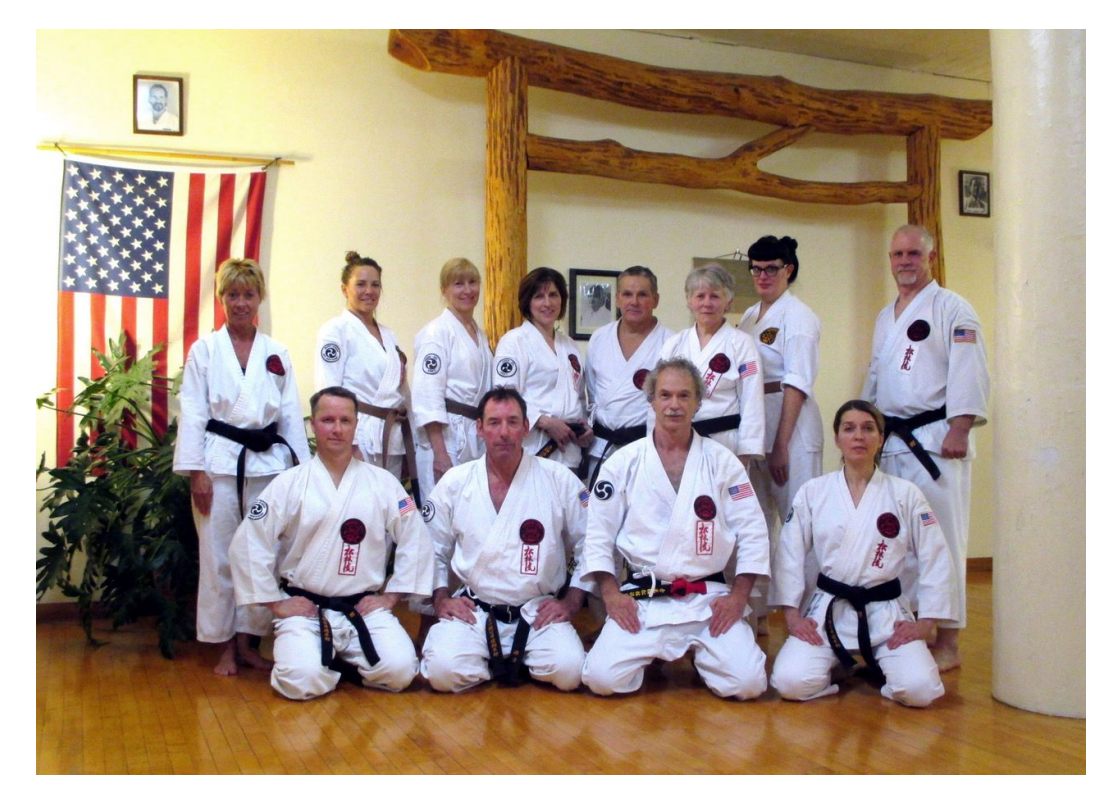
A spirited class was held before heading out to Boston's 15th anniversary work out.

out the kaia opening at the top of our entrance door. If you have been here you know what I speak of. Come see it.