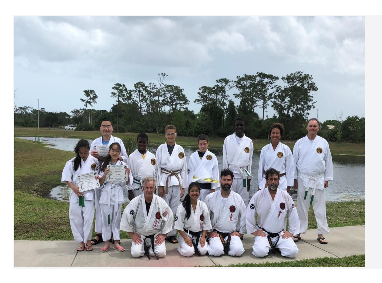
"When one door closes, another one opens."