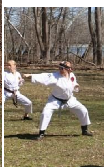
Domo Arigato Gozaimasu,