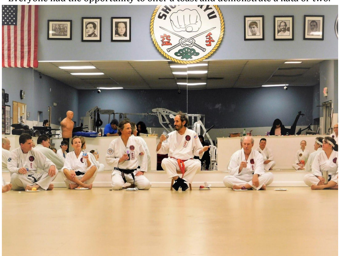
Everyone had the opportunity to offer a toast and demonstrate a kata or two.